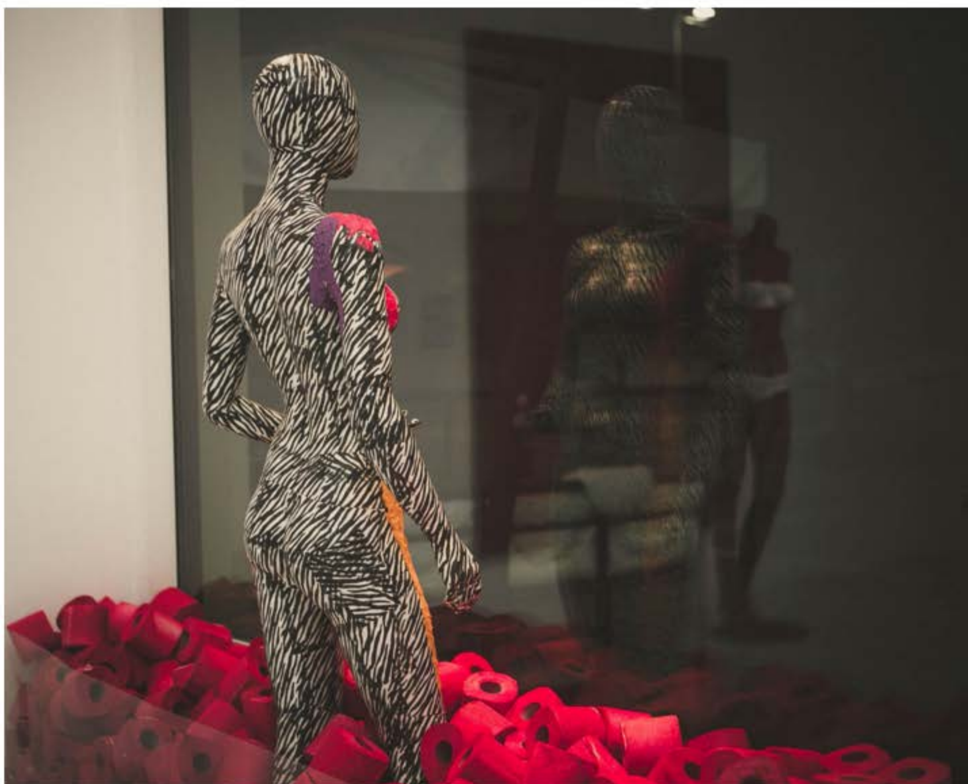
"Toilet paper beauty" Exhibition