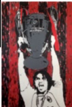
BELOW CHAMPIONS, 2014, acrylic and rough paper on canvas, 100 x 120 cm