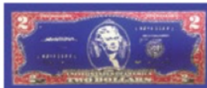
QUANTZAKUMU After Marco Biondini, 2011, acrylic on canvas, 120 x 130 cm